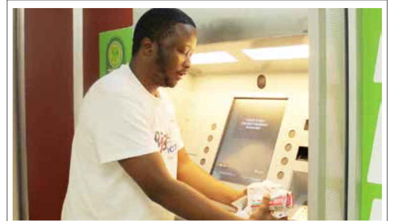
Yuniti ya Kabomelemo e tla kgontsha balwetse go fitlhelela tlhokomelo ya boitekanelo e e boleng.

renseng ya Boditšhabatšhaba ya AIDS e e neng e tshwaretswe kwa Durban mo malobeng, Tona ya Boitekanelo Aaron Motsoaledi o tlhalositse gore Aforika Borwa e samagane le lenaane le le kgologadi la kokelo ya HIV mo lefatsheng ka bophara.