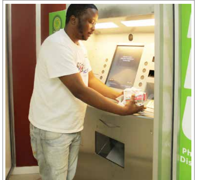
Lumphiko Lwelikhemisi Lelikhapha Imitsi litawenta kutsi bantfu batfole tinsita tetemphilo letifanele.

Akhuluma kuNkhomfayeNgculazi (i-AIDS) Yemave Emhlaba lesandza kubanjwa eDurban, Indvuna Yetemphi-