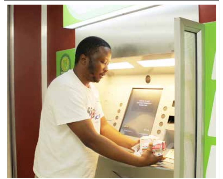
Yuniti ya Khemisi ya u Netshedza (PDU) i do netshedza vhalwadze tswikelelo ya ndondola mutakalo ya ndeme.

U wana mishonga nga nḍila iyi zwi nga kona u leludzela vhatu vane vha khou wana dzilafho la HIV u wana mishonga yavho.