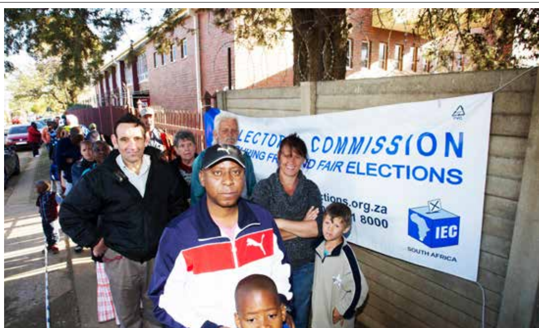
South Africans came out in numbers to cast their votes in the 2016 Local Government elections.