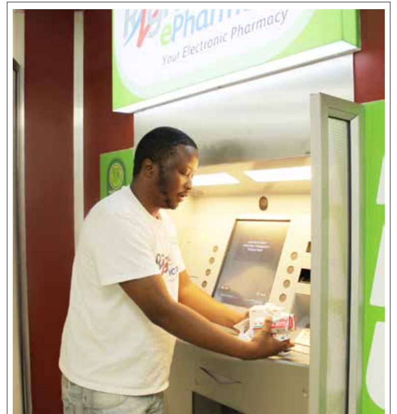
Yuniti yo Phakela Mirhi yi ta nyika vavabyi mfikelelo wa nhletelo wa rihanyo wa xiyimo xa le henhla.

Loko a vulavula eka Khomferense ya AIDS ya Matiko hinkwawo eDurban sweswinyana, Holobye wa Rihanyo Aaron Motsoaledi u vurile leswaku Afrika-Dzonga ri fambisa nongonoko wa vutshunguri bya HIV lowukulu emisaveni. "Nomboro ya vavabyi lava