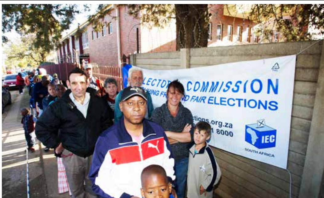
South Africans came out in numbers to cast their votes in the 2016 Local Government elections.