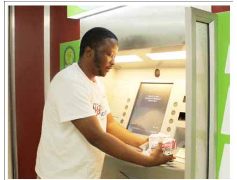
I-PDU izakusiza iingulani ngendlela elula yokufikelela itjhejo lezamaphilo lezinga eliphezulu.

Nagade akhuluma mhlapha kuKhonferensi yeNtumba-