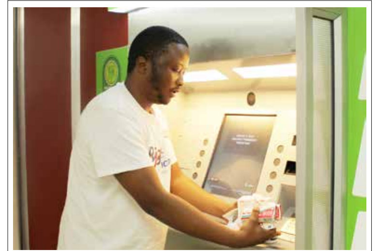
Icandelo lokuKhupha amaYeza (i-PDU) liza kubonelela uluntu ngeenkonzo zezempilo ezisemgangathweni.

Ukufumana amayeza ngale ndlela kunamathuba amahle okwenza lula ukuba abantu abasebenzisa amayeza e-Ntsholongwane kaGawu-