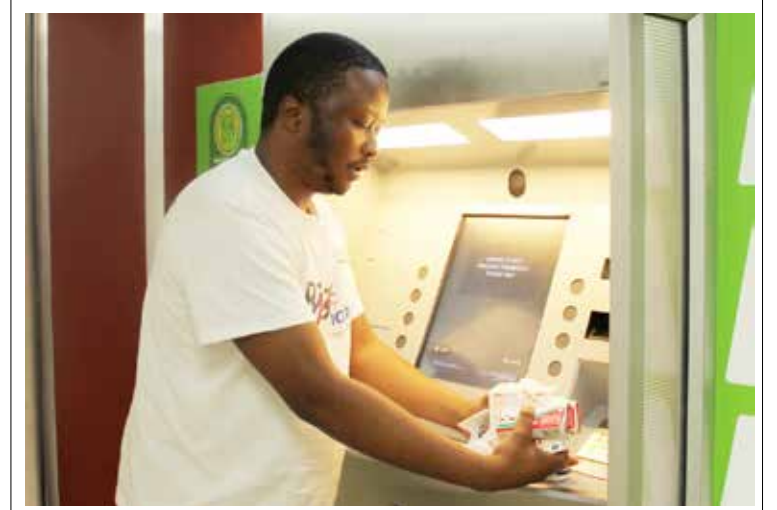
Uphiko Olukhipha Imithi Yasekhemisi luzonikeza iziguli ithuba lokufinyelela ukunakekelwa kwezempilo okuseqophelweni eliphezulu.

Ukuthola imithi ngale ndlela kusemathubeni okwenza kube lula kubantu abathola imishanguzo yegciwane lesandulelangculazi (i-HIV) uku-