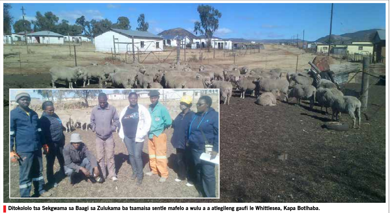
Ditokololo tsa Sekgwama sa Baagi sa Zulukama ba tsamaisa sentle mafelo a wulu a a atlegileng gaufi le Whittlesea, Kapa Botlhaba.

“Mogopolo otlhe wa Indibano ke go ungwela setšhaba.”