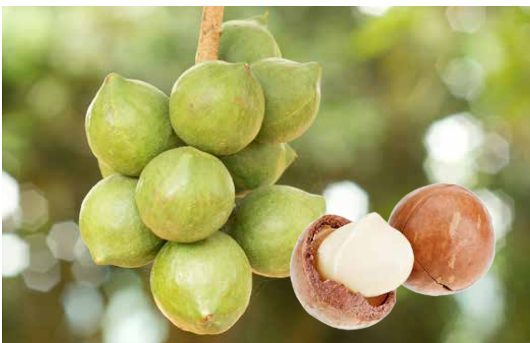
Ditokomane tsa boleng tsa macadamia di tlhagisiwa mo mafelong a a farologaneng kwa Kapa Botlhaba.