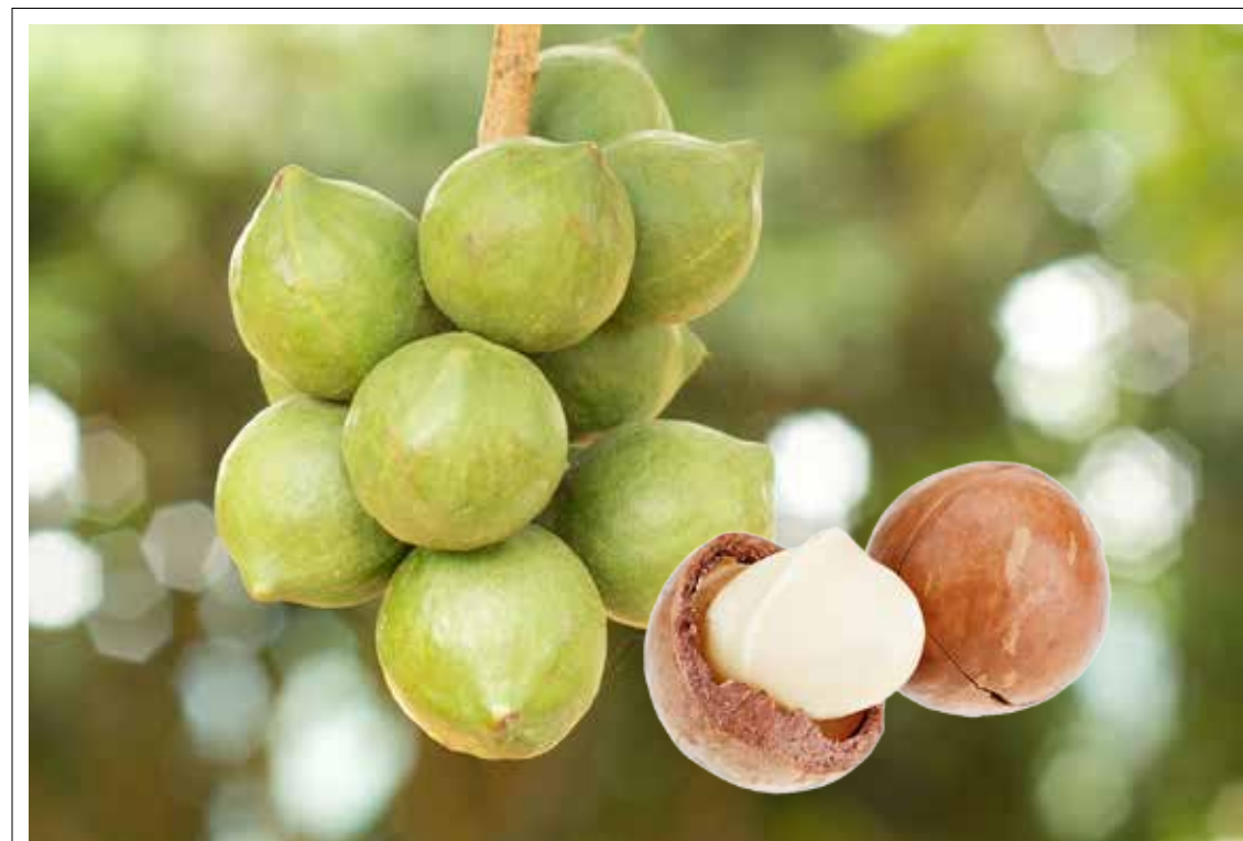
Emantongomane e- macadamia lasezingeni lelisetulu akhicitwa etindzaweni letahlukene eMphumalanga Kapa.