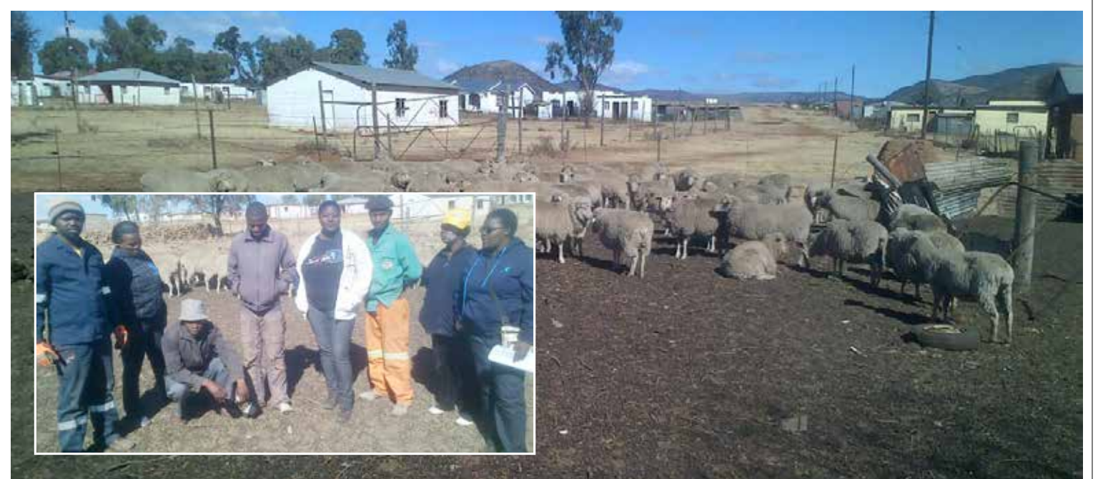
Amalunga we-Zulukama Community Trust aphumelele ekukhiqizeni ivolo hlanu kwe-Whittlesea, esePumalanga Kapa.

INDibano Projects isebenzisana nabantu beendawo zemakhaya ukuphumelelisa ituthuko kezomnotho. Umsebenzayo kubuthelela iimali ezizakusetjenziselwa amahlelo wetuthuko, khulu