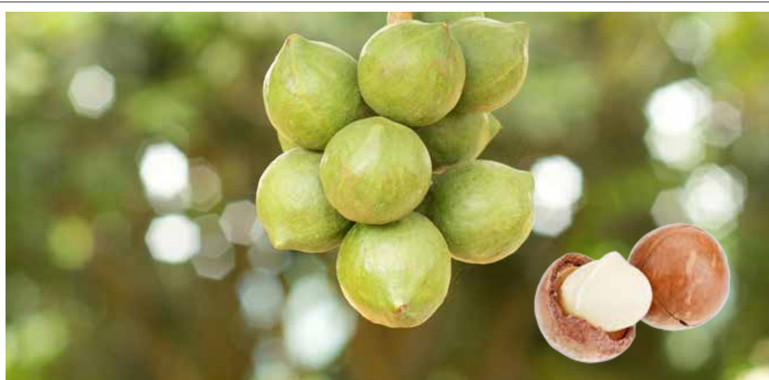
Amantongomani we-macadamia wezinga eliphezulu akhiqizwa mahlagothi woke weendawo zePumalanga Kapa.