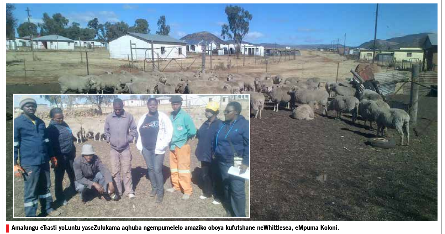
Amalungu eTrasti yoLuntu yaseZulukama aqhuba ngempumelelo amaziko oboya kufutshane neWhittlesea, eMpuma Koloni.

Lo mbutho waqalwa yi-Phambili Vuna, eyinka-