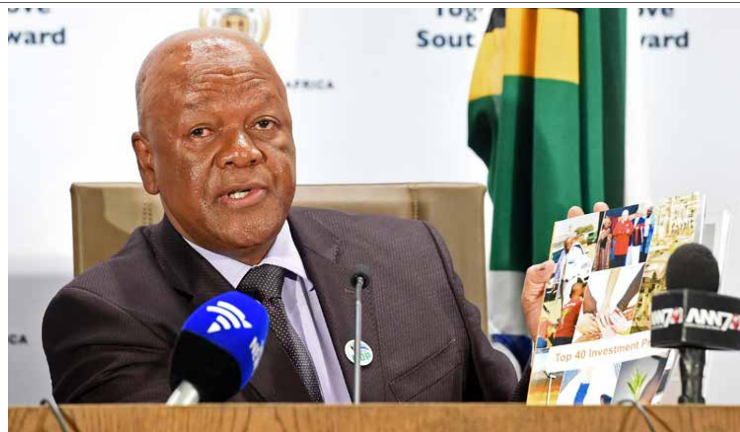
Minister in The Presidency for Planning, Monitoring and Evaluation, Jeff Radebe announced a plan to support small business and cooperatives.