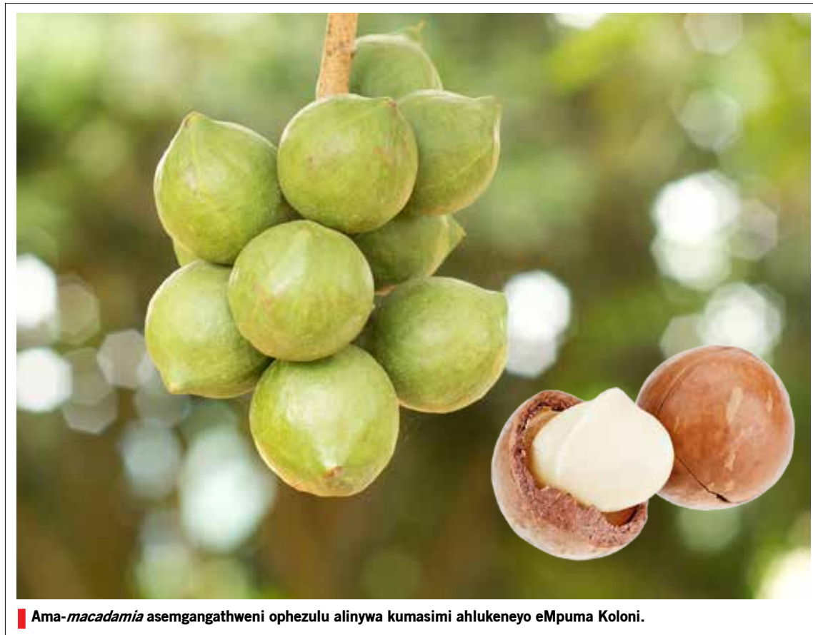
Ama-macadamia asemgangathweni ophezulu alinywa kumasimi ahlukeneyo eMpuma Koloni.