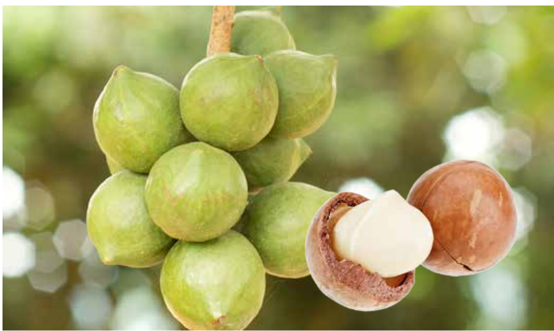
Amanati ama-macadamia asezingeni eliphezulu akhiqizwa ezindaweni ezihlukahlukene eMpumalanga Kapa.