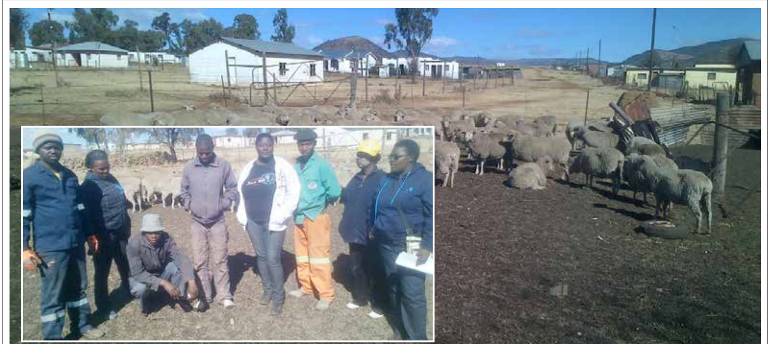
Amalunga eZulukama Community Trust aqhuba ngempumelelo izikhungo zoboya bezimvu eduze ne-Whittlesea, eMpumalanga Kapa.