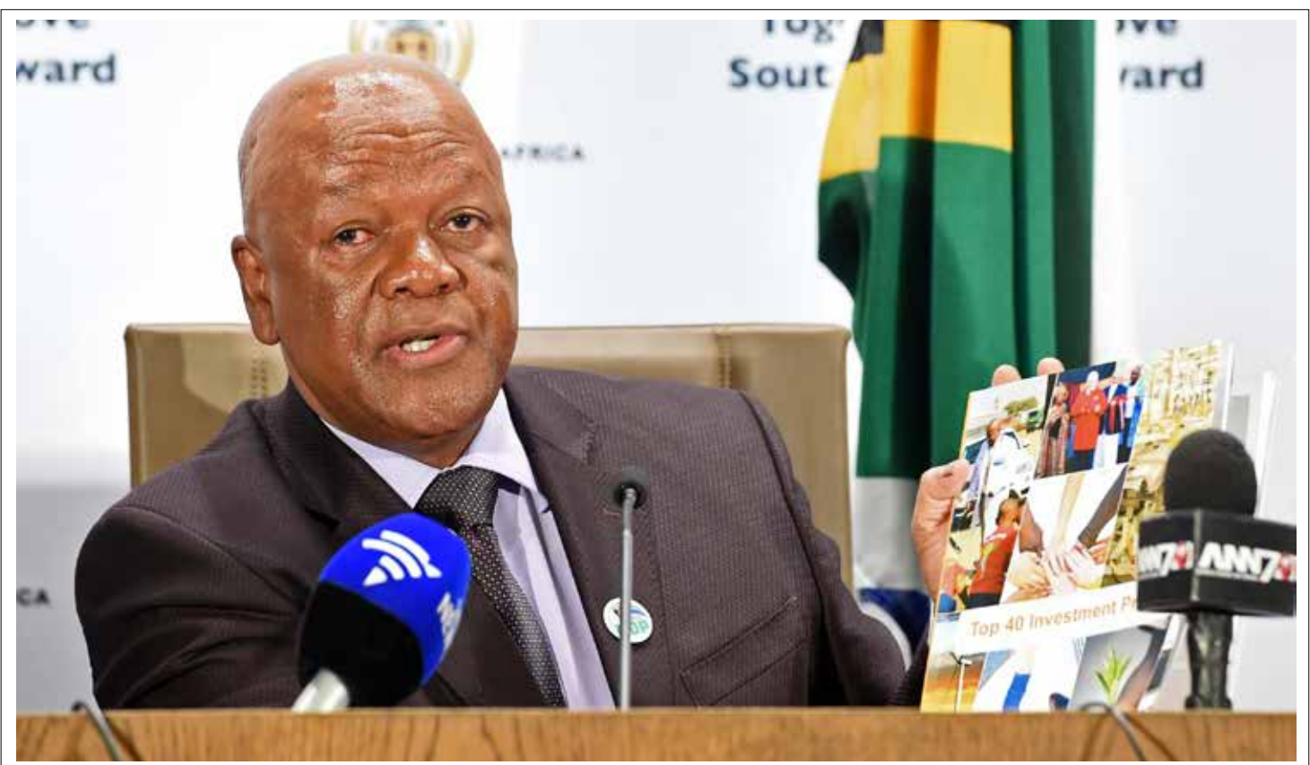
Minister in The Presidency for Planning, Monitoring and Evaluation, Jeff Radebe announced a plan to support small business and cooperatives.