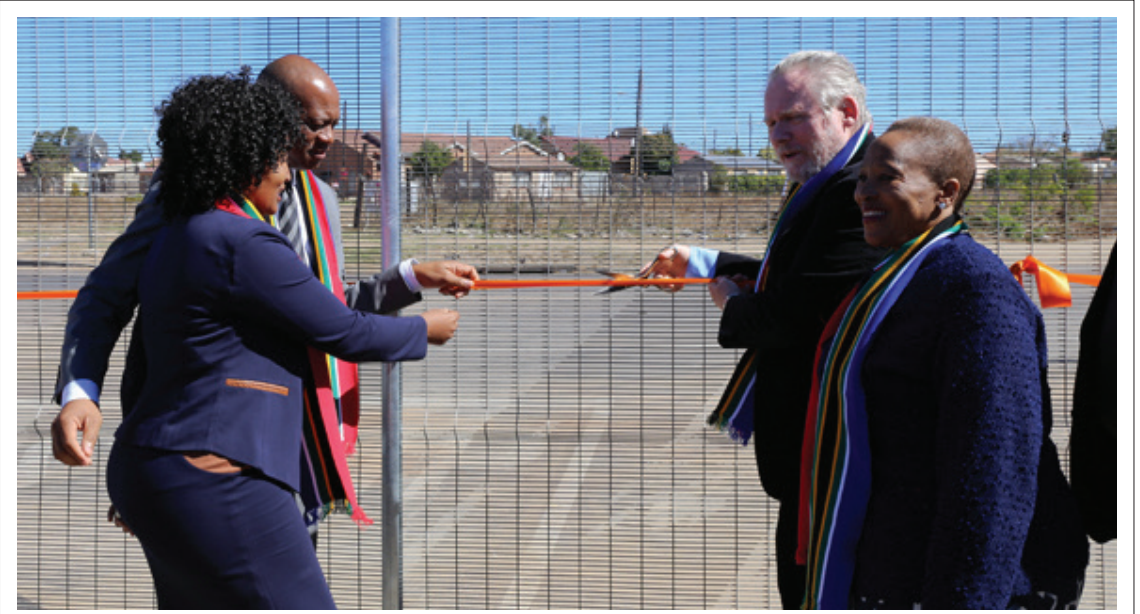
The Department of Trade and Industry spent R21 million for the first phase of the Seshego Industrial Parks.