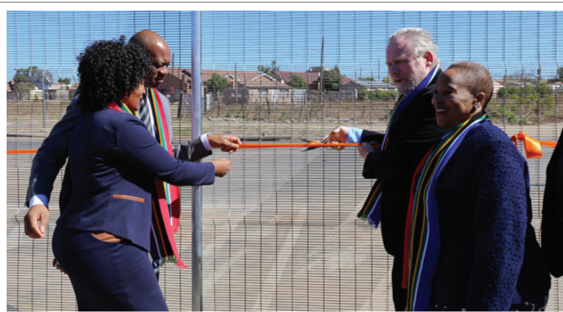
The Department of Trade and Industry spent R21 million for the first phase of the Seshego Industrial Parks.