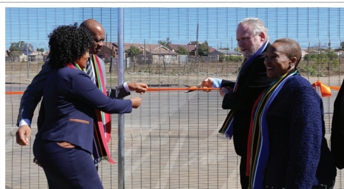
The Department of Trade and Industry spent R21 million for the first phase of the Seshego Industrial Parks.