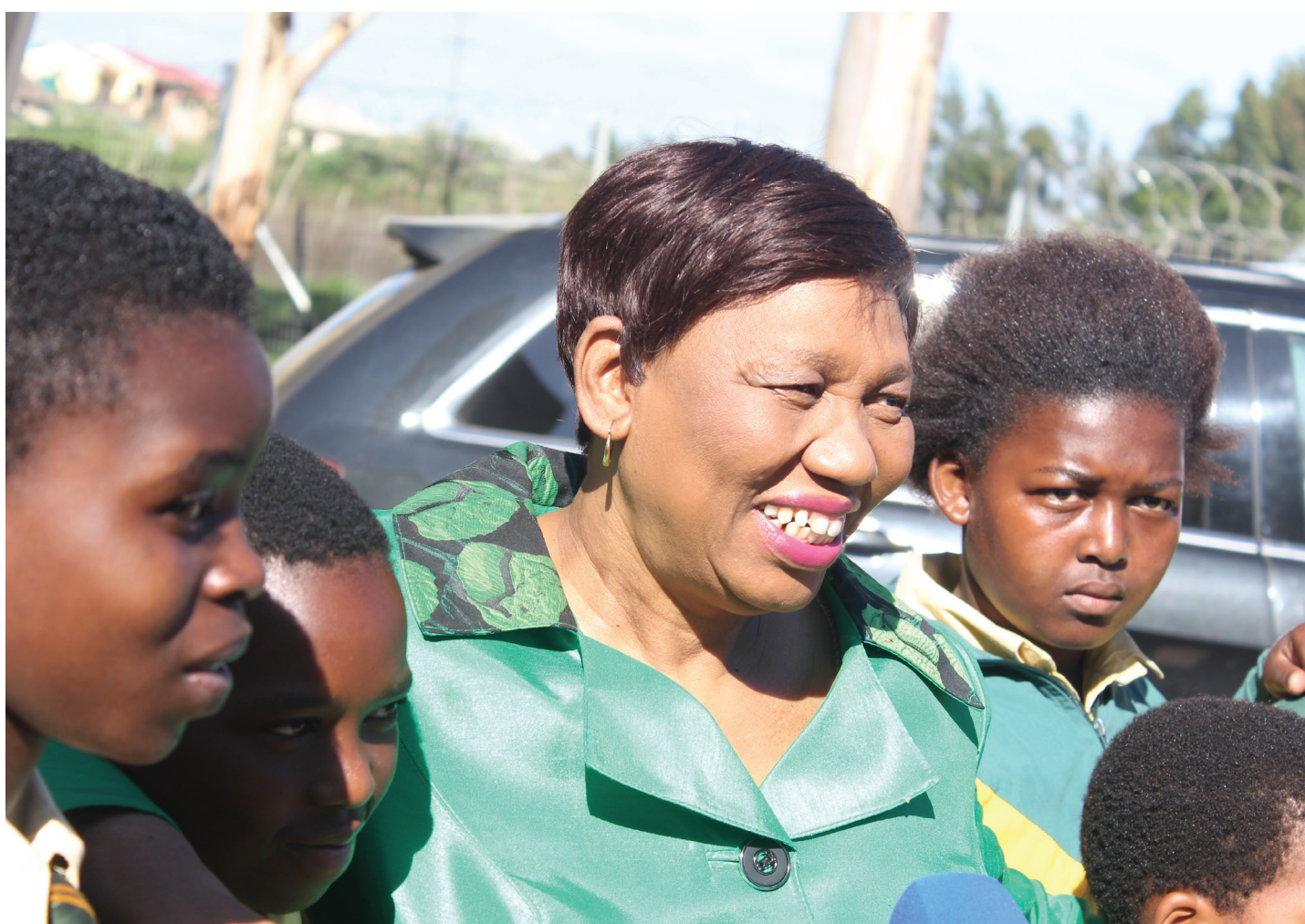
Minister of Basic Education Angie Motshekga interacts with learners at the launch of Bhungu Junior Primary school in Libode.