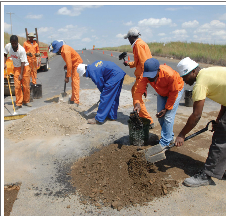
■ Dimilione tša bašomi bao ba lefšago tefo ya fase ba tla holega go tšwa go meputso ya fasefase ye mpsha.

"Go thomeng ga yona ngwaga wo o tlogo, Afrika Borwa e tla ba