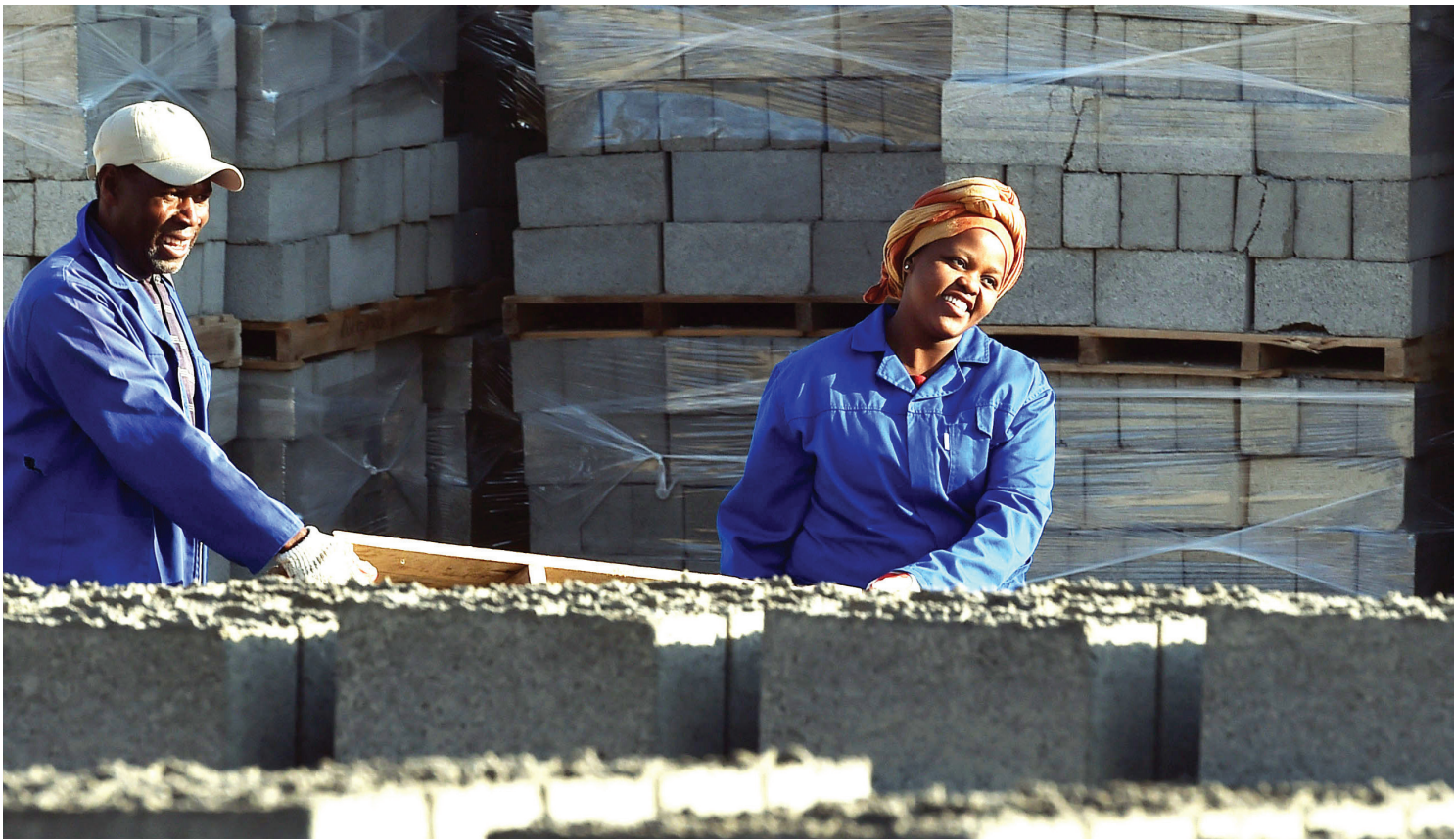
■ Government increases efforts to build an enabling environment for job creation.