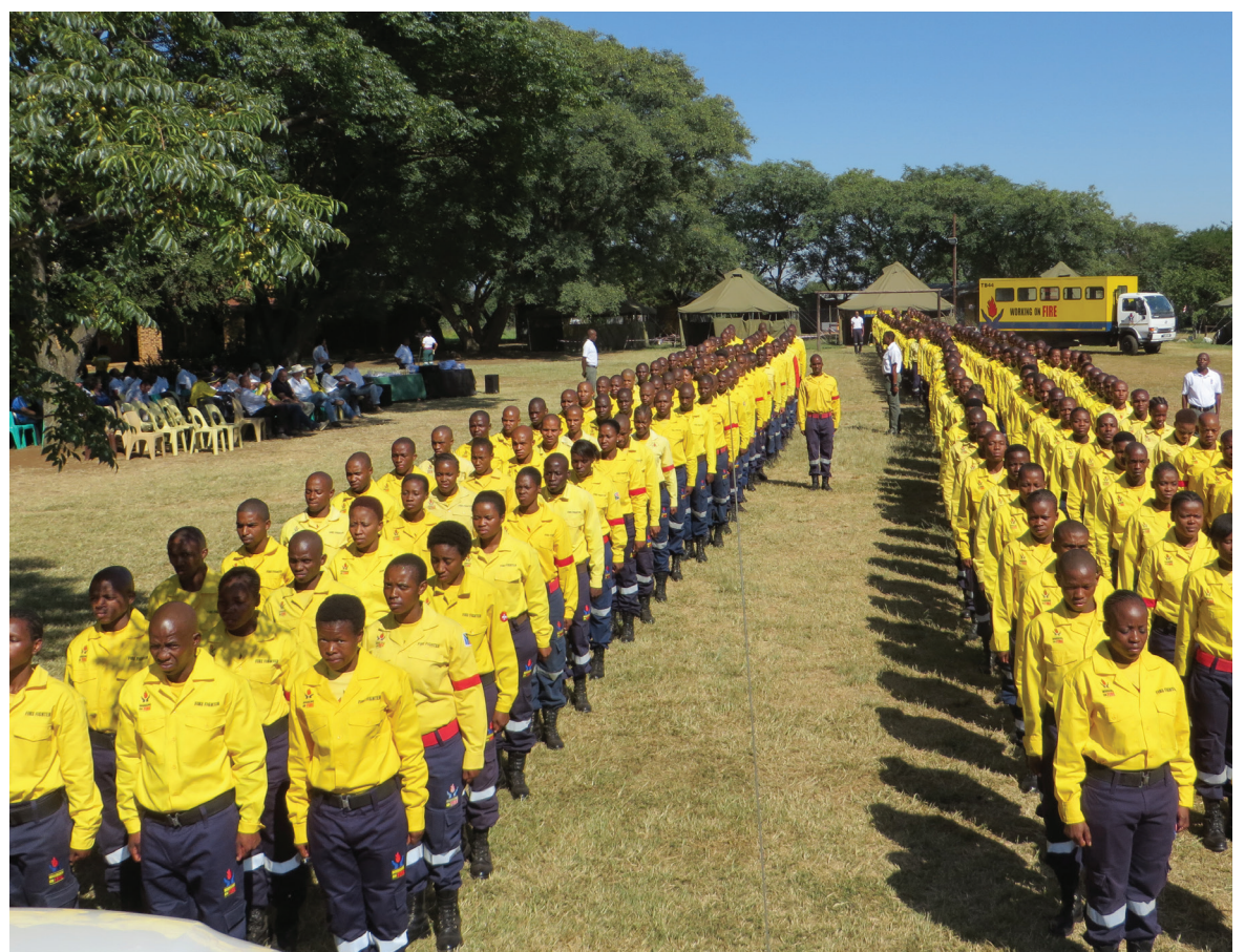
■ Lenaneo la Working on Fire , leo le thekgwago ka ditšhelete ke Kgoro ya Merero ya Tikologo gape e le Lenaneo la Mešomo ya Setšhaba ye e Katolōšitšwego, le ikemišeditše go fa dibaka go masogana le makgarebe.