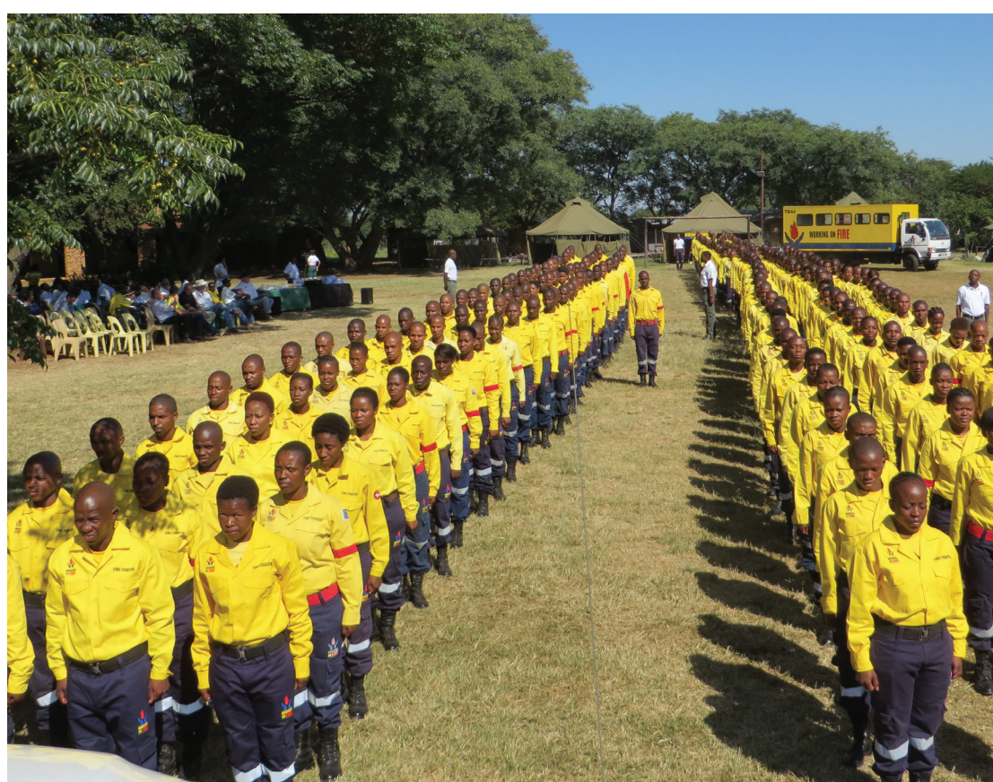
■ Lenaane la Go Dira ka Molelo, leo le tlamelwang ka matlole ke Lefapha la Merero ya Tikologo, e bile e le gape Lenanekamoloso la Ditiro tsa Setšhaba, le ikaelela go tihanela makau le makgarebe ditšhono.