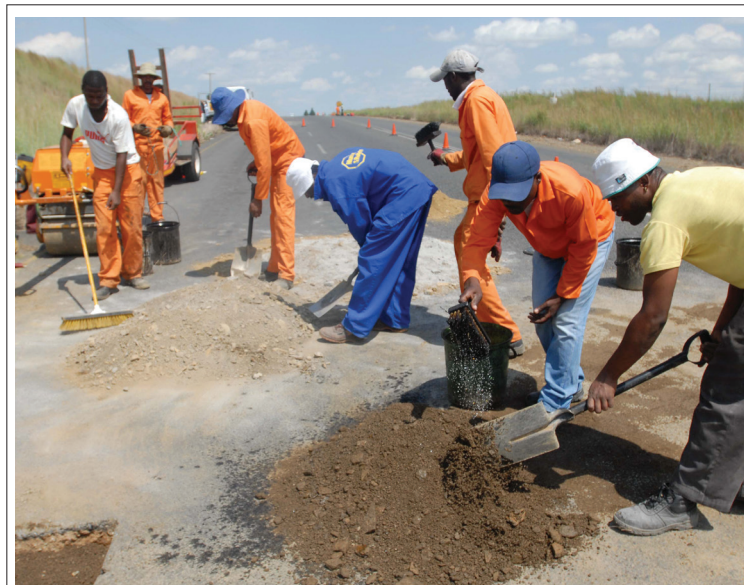
■ Badiri ba le dimilione milione ba ba amogelang megolo e e e kwa tlase ba tla ungelwa go tswa mo moputsomonnyeng o mošwa.

ona mo ngwageng o o tlang, Aforika Borwa o tla ikamanya le dinaga di le mmalwa go ralala lefatshe tse di tsentseng tirisong moputsomonnye wa bosetšhaba jaaka sediriswa sa tlhabololo ya ikonomi gammogo le loago,” a rialo.