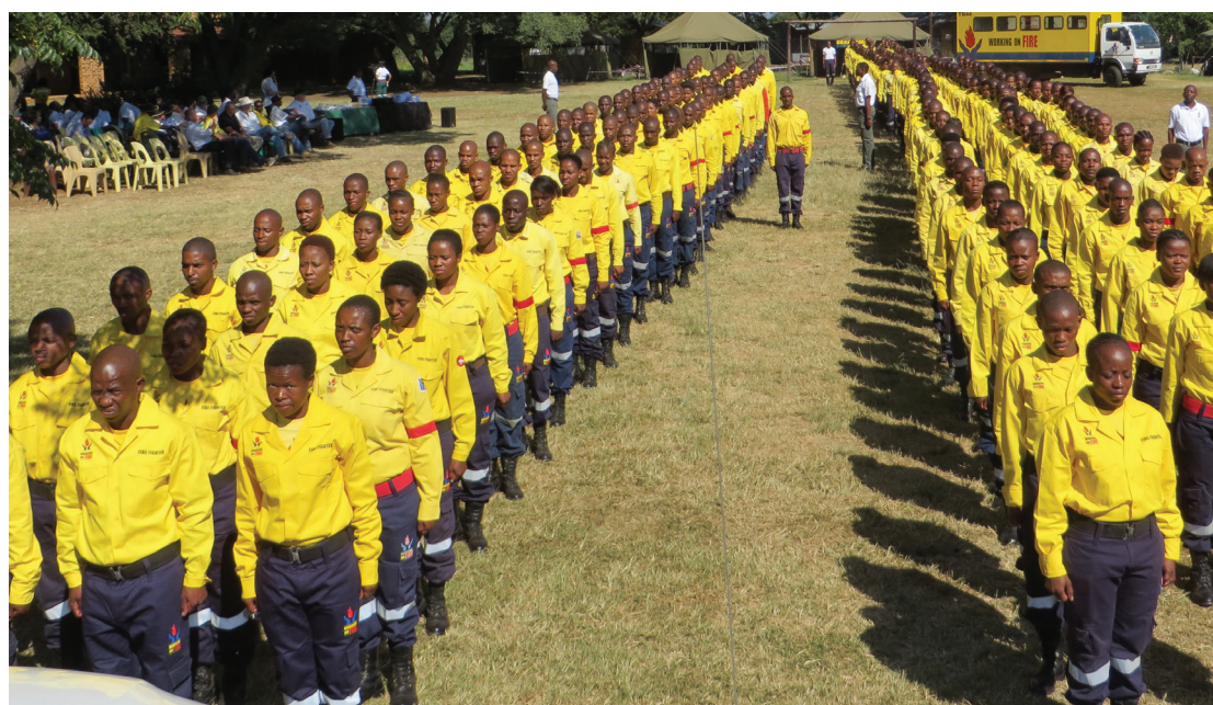
Uhlelo lwe-Working on Fire, oluxhaswe nguMnyango Wezemvelo futhi okuwuhlelo lwemisebenzi Yomphakathi Olusabalele, luhlose ukuhlinzeka amathuba kwabesilisa nabesifazane abasebancane.

lo, abantu kumele babe: • Yizakhamizi zaseNingizimu Afrika