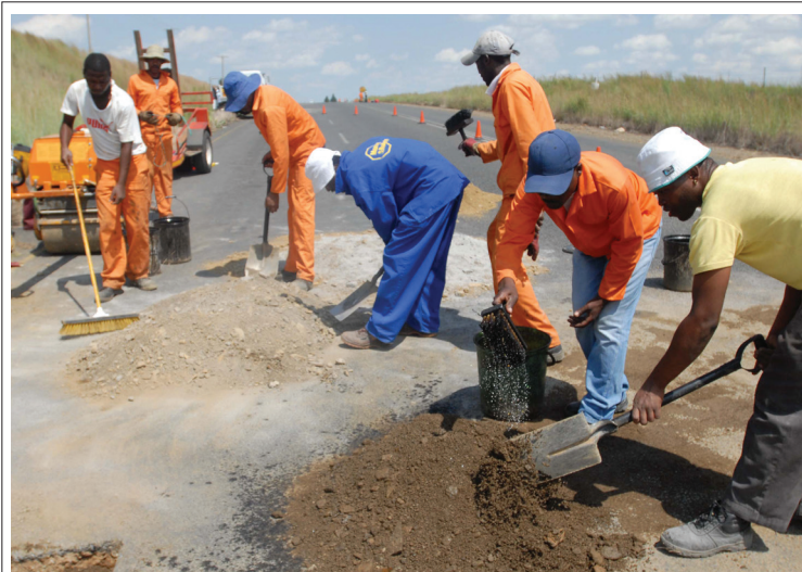
■ Izigidi zabasebenzi abahola kancane bazohlomula ngeholo eliphansi elisha.

"Ekuqaleni kokusebenza kwalo ngonyaka ozayo, iNingizimu