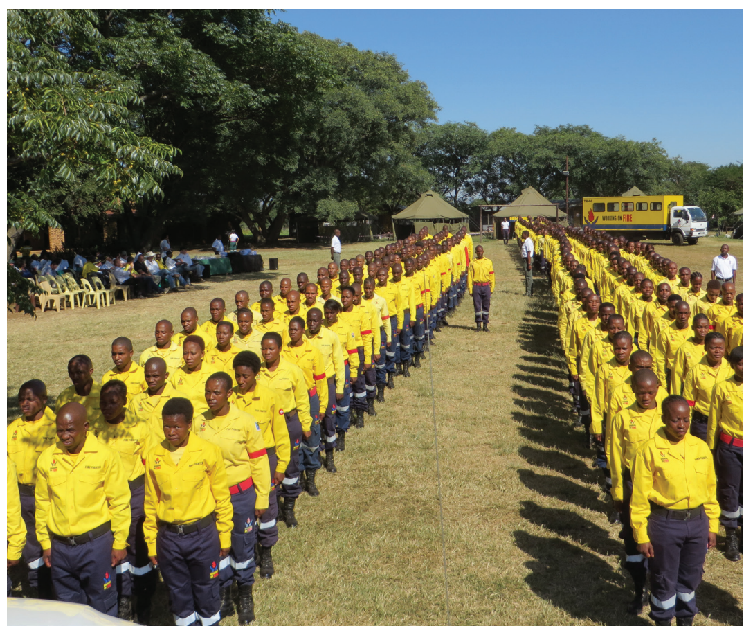
Kusebenta eLuhlelweni Lwekusebenta Ngemlilo, lolusekelwe ngetimali Litiko Letemvelo futsi Luhlelo Lwemisebenti Yemango Leyengetiwe (i-EPWP), loluhlose kudala emafuba kubantfu labasha.