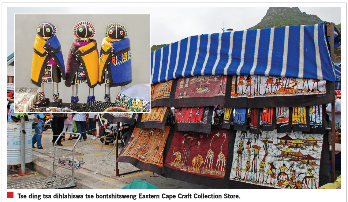
■ Tse ding tsa dihlahiswa tse bontshitsweng Eastern Cape Craft Collection Store.

“Leha tebello e le hore dikgwebo di nyolle moruo, sena ha se hangata se