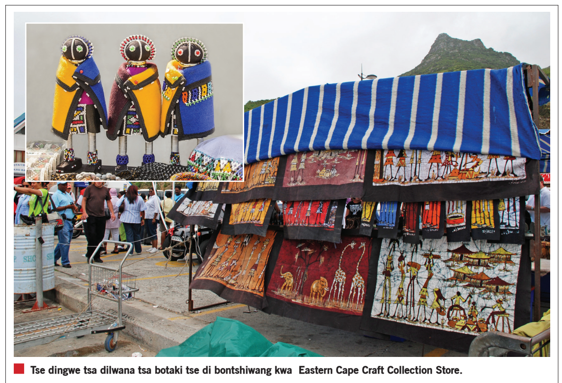
■ Tse dingwe tsa dilwana tsa botaki tse di bontshiwang kwa Eastern Cape Craft Collection Store.

“Le fa Dikgwebopotlana di na le bokgoni jwa go godisa ikonomi, seno ga se itiragalele fela. Ke tiro ya togamaano ya tshegetso ya Dikgwebopotlana e e farologaneng, e e totileng lephata mme e lebeletse kgolo go samagana le dikgoreletsi tse di dirang gore dikgwebopotlana