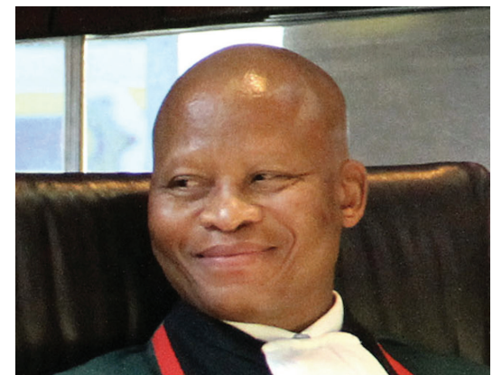
NguMhlonishwa Mogoeng Mogoeng.