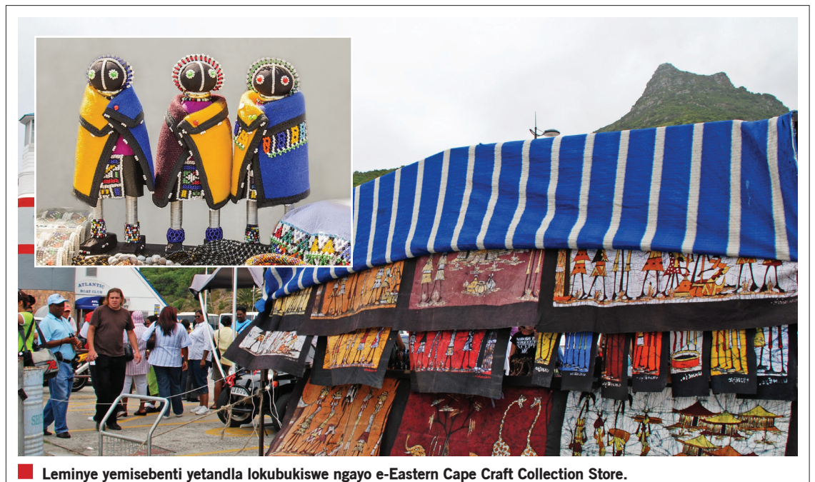
■ Leminye yemisebenti yetandla lokubukiswe ngayo e-Eastern Cape Craft Collection Store.

“Nanome emabhizinisi lamancane anemandla eku-daleni kukhula kwemnotfo loku akusho kutsi kumane kutentekela nje. Kuba ngumsebenti wendlelalisu lelehlukile lekusekela ema-