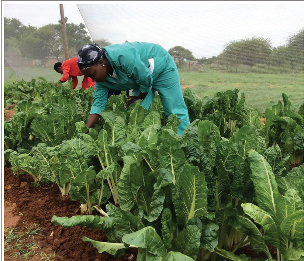
Smallholder farmers are expected to play a major role in the implementation of Operation Phakisa for Agriculture, Land Reform and Rural Development.