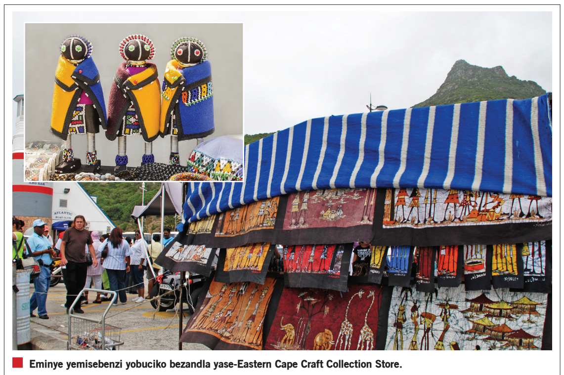
■ Eminyane yemisebenzi yobuciko bezandla yase-Eastern Cape Craft Collection Store.

“Yize noma amabhizinisi amancane ekwazi ukusiza ekukhuleni komnotho lokhu kuye kungenzeki kanyekanye. Lokhu kungumsebenzi wecebo lokwesekwa kwamabhizinisi amancane elehlukile, eligxile emkhakheni othile kanye nenjongo yalo engoku-