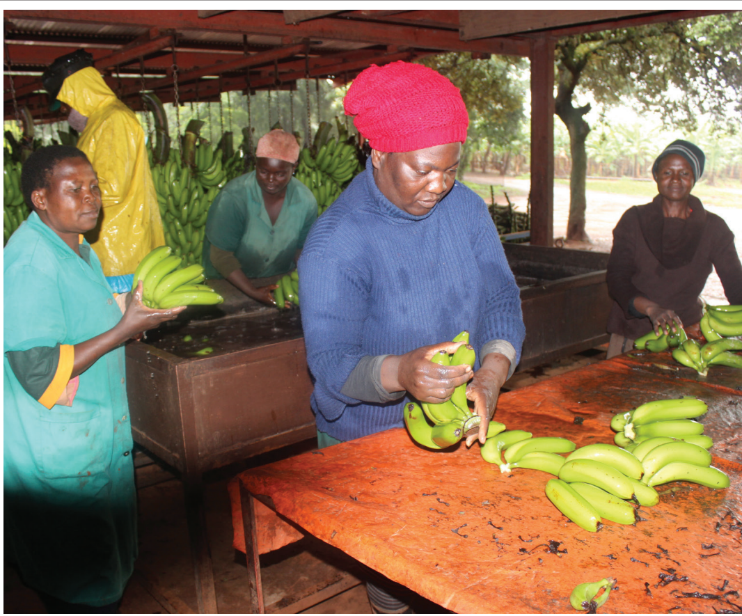
■ Basebetsi CPA ya Ravele ba hlatswa dipanana tse qetwang ho kguwa sebakeng sa CPA sa ho pakela. Dipanana tsena di tla rekisetswa dimaraka tsa lehae ho rapalla le Porofense ya Limpopo.

MOKGATLO WA THEPA YA SETJHABA (CPA) wa Ravele o bile le dikatleho tse fapafapaneng kamora hore ba leme naha eo ba e fumaneng kamora hore ba atlehe ho busetsweng ha bona lefatshe. Kajeno ba rekisa ka katleho dihlahiswa tsa bona tse foreshe ka hare ho naha le mafatsheng a ka ntle.