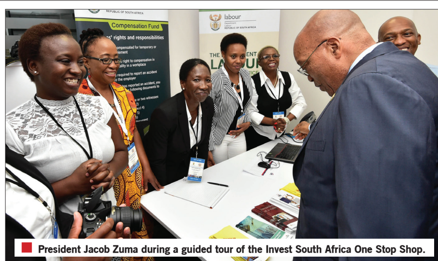
President Jacob Zuma during a guided tour of the Invest South Africa One Stop Shop.

Launching InvestSA President Jacob Zuma said The One Stop Shop will provide a more coordinated, streamlined and professional service to those who wish to set up a business,” President Zuma. V