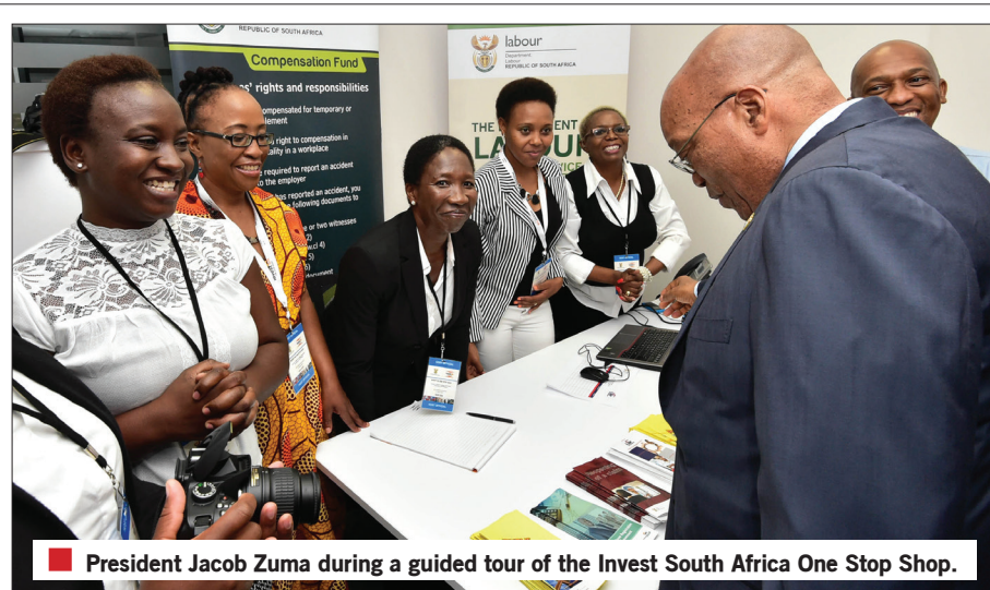
■ President Jacob Zuma during a guided tour of the Invest South Africa One Stop Shop.

Launching InvestSA President Jacob Zuma said The One Stop Shop will provide a more coordinated, streamlined and professional service to those who wish to set up a business," President Zuma. ■