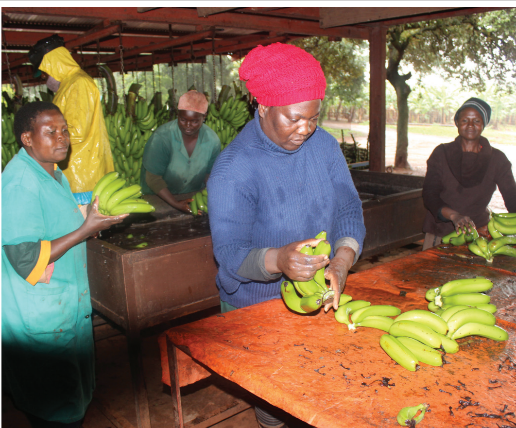
Badiri kwa CPA ya Ravele ba tlhatswa dipanana tse di foreše kwa bopakelong jwa CPA. Dipanana di tla rekiswa kwa mebarakeng go ralala porofense ya Limpopo.

morokotso wa R9.7 milione ngogola mme e beetse thoko dipeeletso tsa R11 milione fa e sale ka 2014. Morokotso wa bona o ntse o tswelela go tlhatloga. Ka 2014, CPA e ne ya dira R3.5 milione mme ya e tokafatsa go nna R5.1 milione ka 2015.