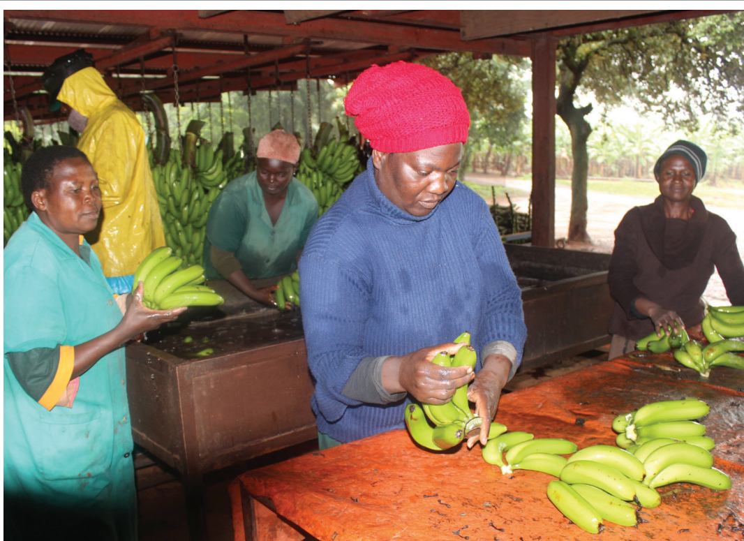
■ Tisebenti e-Ravele CPA tigeza bobhanana labasandza kukhiwa endlini yekupakishela ye-CPA. Labobhanana batawutsengiswa etimakethe tendzawo kuso sonkhe Sifundza saseLimpopo.

INHLANGANO YETEMHLABA YEMMANGO WaseRavele (i-Ravele CPA) ibe nemphumelelo lecubene yekulima umhlaba labawutfole ngemuva kwukuphumelela kwesicelo sabo sekubuyiselwa umhlaba. Lamuhla batsengisa imikhicito yabo lesandza kukhiwa kuleli lakitsi nakulamanye emave emhlaba.