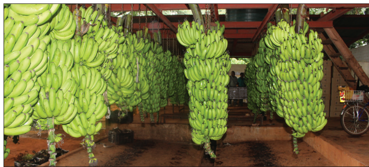
● Ichubeka isukela elikhasini le-1

"Wasungula tinchubo letinhle kakhulu letavusa letimphiko tatala tenta imali futsi ngalokumiselwe kulenkhambo lenhle yekusebenta sabese sincuma kumnika ikontileka yeminyaka lesihlanu. Le-CPA itsengisa imikhicito yayo ePitoli naseJozi (emalitjisi). Itse-ngisa emantongomane ema-macadamia emaveni angaphandle eChina, eUnited States, eMiddle East, eYurophu naseCanada. Emakotapeni wona atsengiselwa iFrance." V