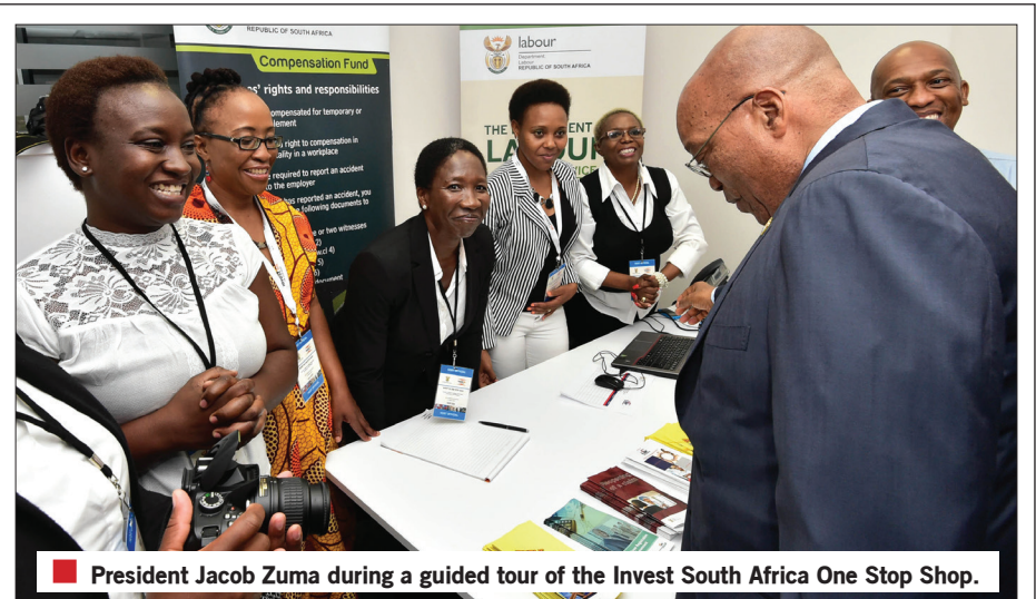
President Jacob Zuma during a guided tour of the Invest South Africa One Stop Shop.

Launching InvestSA President Jacob Zuma said The One Stop Shop will provide a more coordinated, streamlined and professional service to those who wish to set up a business," President Zuma. ■