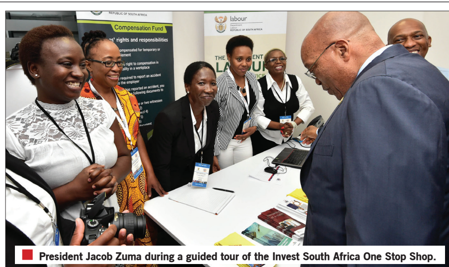
■ President Jacob Zuma during a guided tour of the Invest South Africa One Stop Shop.

Launching InvestSA President Jacob Zuma said The One Stop Shop will provide a more coordinated, streamlined and professional service to those who wish to set up a business," President Zuma. ■