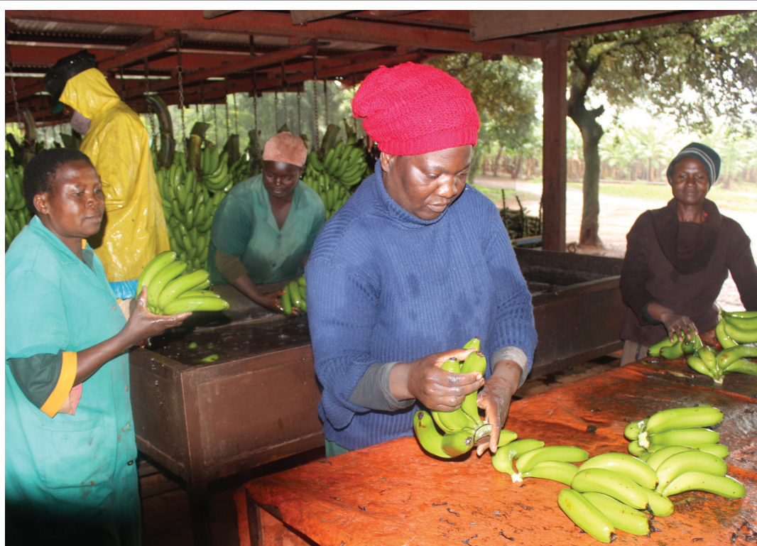
■ Abasebenzi be-Ravele CPA bahlanza amabhanana asandukuvunwa ezikweni lokupakela iinthelo. Amabhanana la azokuthengiswa emmarageni zoke ezisesifundeni se-Limpopo.

IHLANGANO YEPAPHA YOMPHAKATHI we-Ravele (i-Ravele CPA) ibe nepumelelo evangeneko ngokulima inarha ngemva kwepumelelo yoku-fumana inarha eyabuyiselwa yona. Namhlanjisi bathengisa isivuno sabo ngelizweni nangaphandle kwemikhawulo.