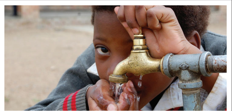
U ya nga ha muvhigo wa vha Mbalombalo, vhadzulapo vha Afrika Tshipembe vha na mutakalo wavhuḡi nahone vho funzea.

U khwiniswa hune ha khou itiwa nga muvhuso ho ita uri sisiṡeme dza mutakalo wa tshishavha dzi wanalee nga maanḡa, na u tsireledzea u fhirisa tshifhinga tsho fhiraho. Nga ṡwaha wa 2016, phesenthe dza 71.4 dza miṡa dzo shumisa kijiniki na zwibadela