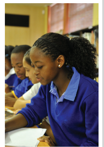
■ Vhagudi vha shuma khwine kha pfunzo dza nṭha arali vho wana pfunzo ya ndeme kha miṛwaha yavho ya u thoma ya tshikolo.

“Khwinifhadzo kha tshiimo itshi tsha kushumele ndi dza ndeme, sa izwi zwi tshi amba