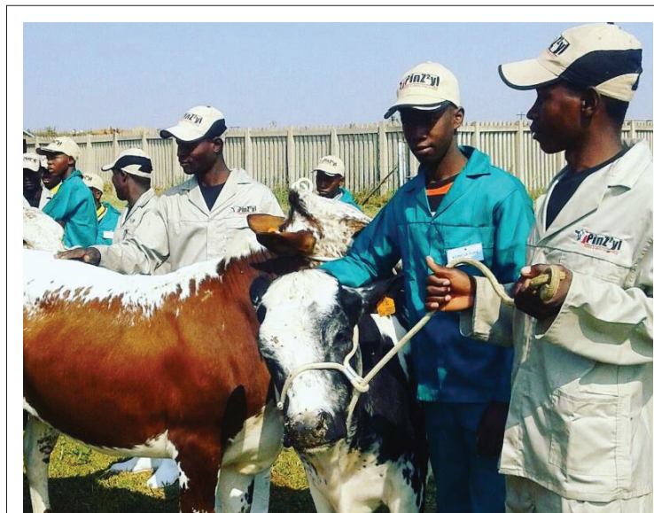
■ Saintsi ya zwifuwo ndi ṛwe ya thero i funzwaho kha tshikolo tsha Sipeshaḽaizesheni tsha Magaliesburg.

TSHIKOLO TSHISWA TSHA sipeshaḽaizesheni tsha Muhasho wa Pfunzo wa Gauteng tsho rwelwaho ṭari zwenezwino ngei Magaliesburg ndi tshinwe tsha zwikolo zwa sekondari dza 27 dzine dzo lavhelelwa u khwinisa tshenzhemo dza zwanḽa zwa vhagudi kha zwikili zwa ndeme zwi ṭoḽeaho kha u alusa ikononi.