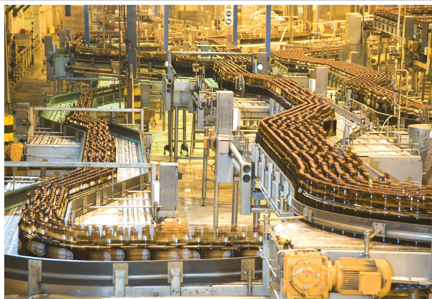
■ To bring about fundamental change in our economy we need more real industrialists, people who own manufacturing businesses and are not just shareholders in someone else's company.