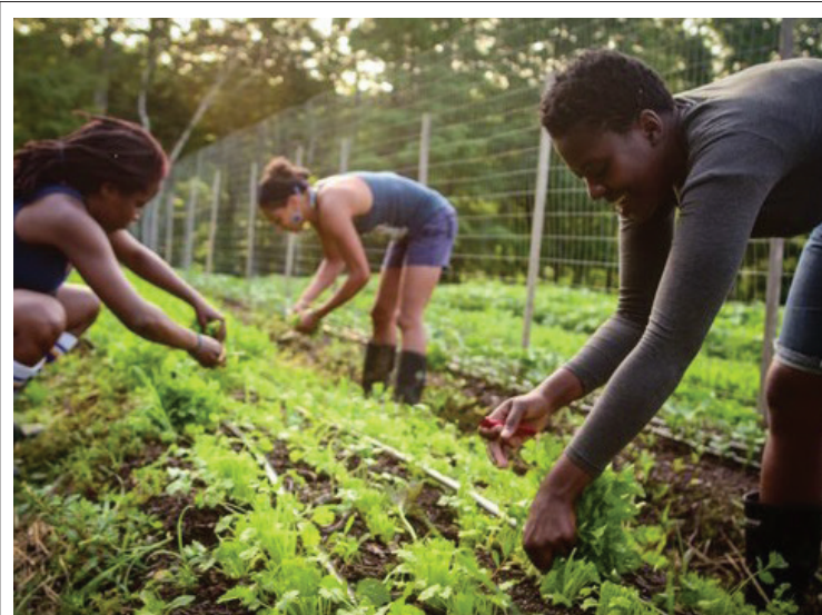
Bantfu labasha KwaZulu-Natal basetfubeni lekuzuzakuloluhlelo lwentfufuko yebalimi labancane.

“Umkhakha wetekulima waseDenmark unesipiliyoni lesikhulu