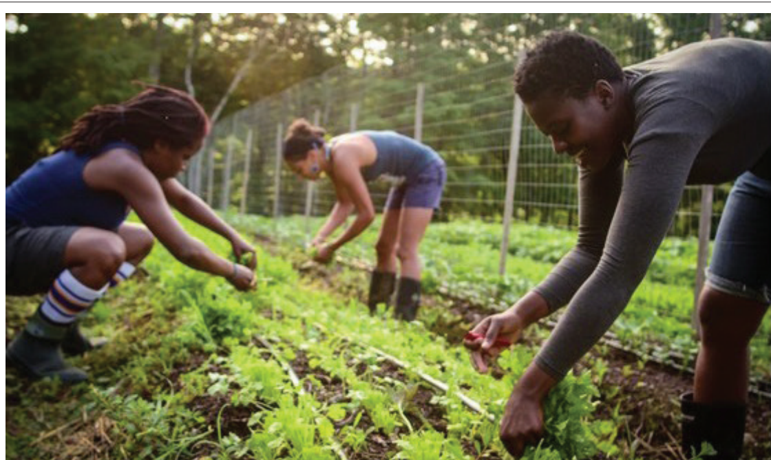
■ Vhaswa vha KwaZulu-Natal vha ḁo vhuvelwa u bva kha mbekanyamushumo ya mveledziso ya vhalimi vha vhaswa.

Vho ḁadzisa nga uri u itela uri Afrika Tshipembe ji kone u kuvhanganya zwiliwa na uri vhulimi