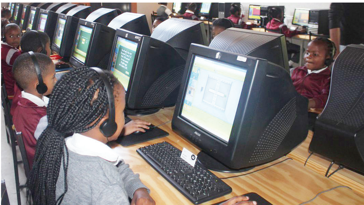
■ Placing key ICT devices in the hands of our teachers and learners has the potential to break the digital divide

OR Tambo addressing the Conference of the Women's Section of the ANC in 1981: "The mobilisation of women is the task, not only of women alone, or of men alone, but of all of us, men and women alike, comrades in struggle."