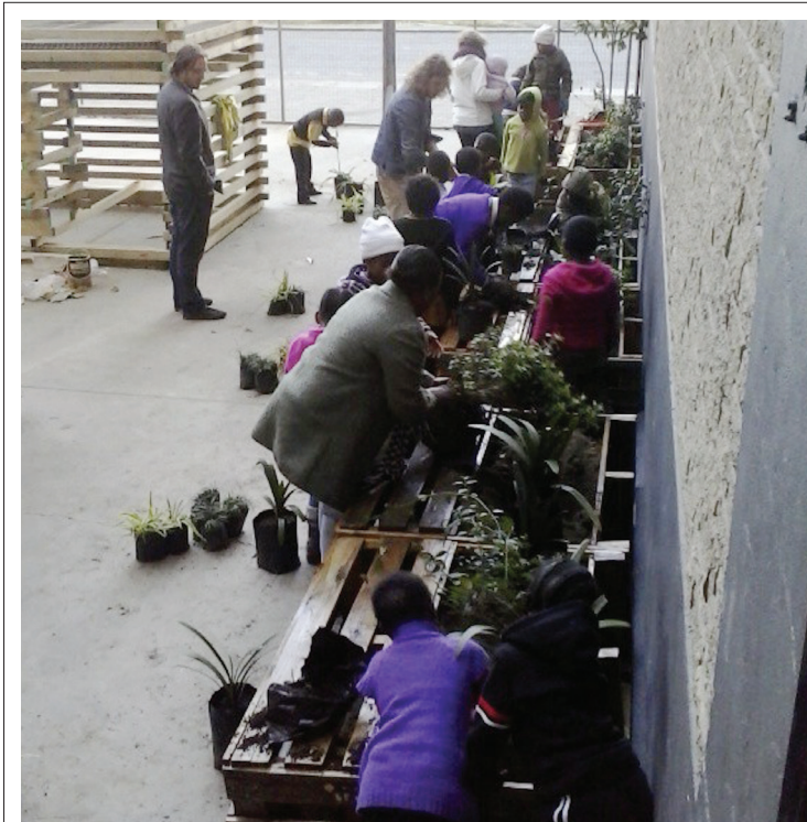
U ḑisa kuhumbulele kwa mbavhalelo ya mupo ngomu tshikoloni.

Tsho pulanelwa u ṅetshedza pfunzo ya ndeme ya ṅthesa, i sa ḑuriho kha vhana vha nga ngomu ḑoroboni, tshikolo tsho vhuvelwa u bva kha thuso ya vhaolazwifhaṭo vha dzulaho Johannesburg na vhaṭaṭi vho gudelaho kha zwa ikonomi ya