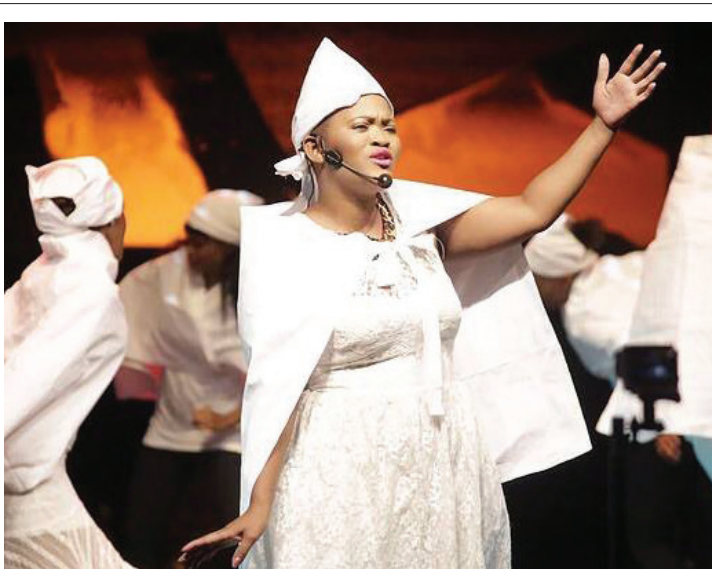
Vho Charmaine Mrwebi na tshigwada tshavho vha shumisa u anetshela zwiṭori u ṭuṭula lufuno lwa u vhalala na u ṅwala.