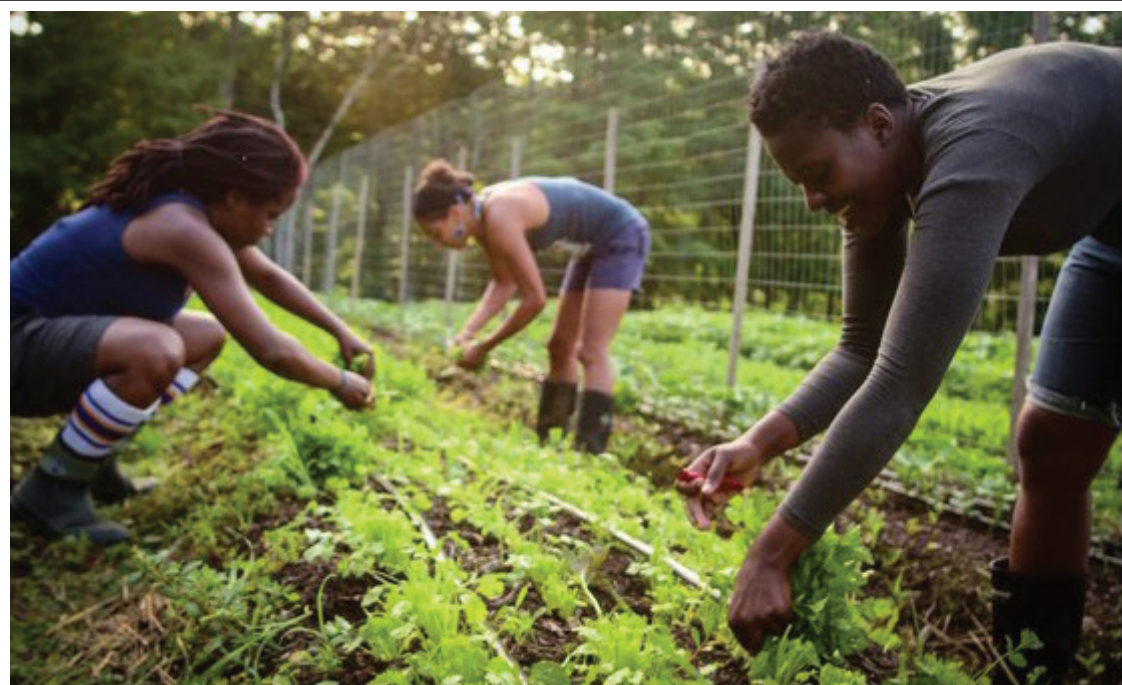
Vanhu lavantshwa va le KwaZulu-Natal va ta vuyeriwa ku suka eka phurogireme ya nhluvukiso wa varimi lavantshwa.

Vukhale bya le xikarhi bya varimivafuwi va bindzu va Afrika-Dzonga byi kwalomuka 63, ku hlamusela MEC. "I swa nkoka leswaku hina tanihi mfumo, hi ku tirhisana swin'we na sekithara ya vurimi, hi kuma tindlela ta ku koka rinoko ra vanhu lavantshwa eka vurimi