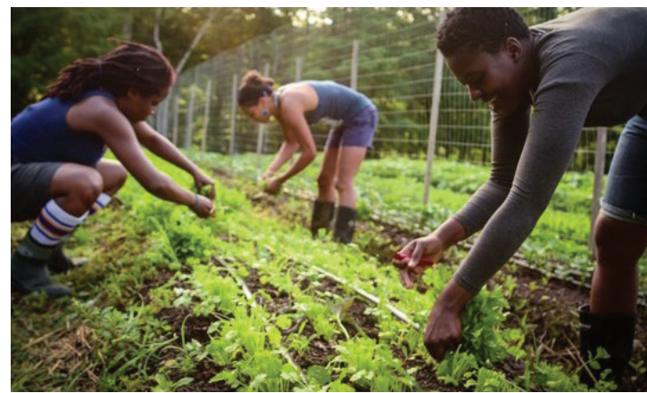
Abantu abatsha baKwaZulu-Natal baza kuxhamla kwinkqubo yokuphuhlisa amafama aselula.

Uninzi lwamafama aseMzantsi Afrika luneminyaka engama-63 ubudala, utshilo u-MEC. “Kuba-