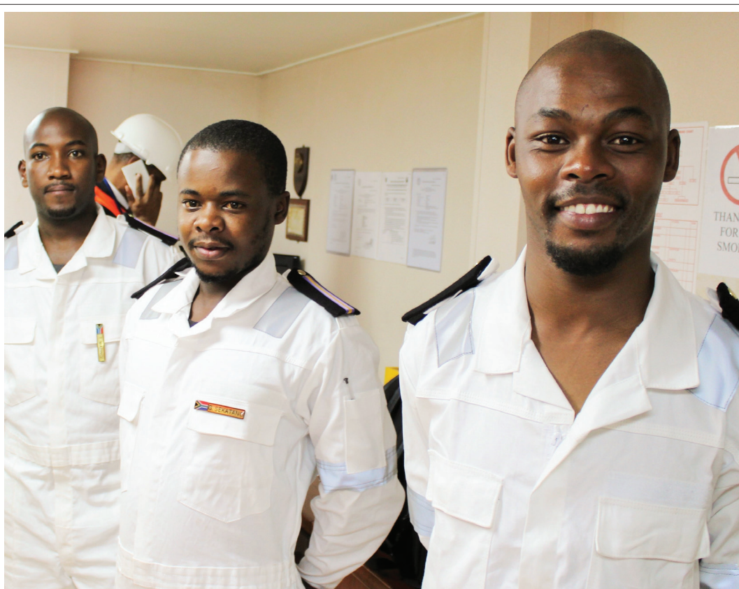
■ The Eastern Cape Maritime Youth Development Programme gives the youth skills and creates jobs in the maritime sector.

NINETY-SEVEN youngsters took to the sea with MSC Cruises to gain work experience and increase their maritime skills.