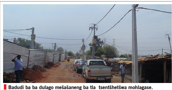
Badudi ba ba dulago mešašaneng ba tla tsentšhetšwa mohlagase.

Mešašana ye e arotšwe ka magoro a mararo. Legoro la