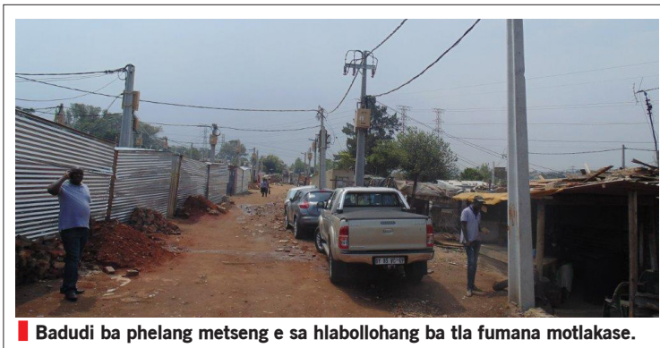
Badudi ba phelang metseng e sa hlabollohang ba tla fumana motlakase.

tse ka dikotwana tse tharo. Sekotwana sa pele ke se tla ntshe-tswang pele ke motsemoholo haufinyana. Hona ho tla late-lwa ke tseo tse tla nkang dilemo tse 10 ho ntlafatswa ha bodulo ba ho qetela bo tla iswa sebakeng se seng.