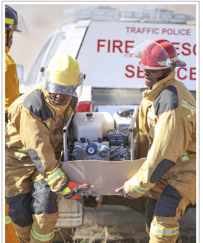
Setsha se setjha sa taolo ya dikoduwa sa Bergville se tla netefatsa tshireletso ya maloko a setjhaba sebakeng seo.

“Hona ho bontsha hantle hore mmuso wa rona o itlammeme ho ntlafatsa metse ya mahaeng. Re ne re sa nahana hore mona Bergville re tla hlola re bana le setsha sa tswantsho ya mollo, re se re sa bue ka setsha sa ho etsa dilaesense tsa dikoloi,” o buile jwalo.