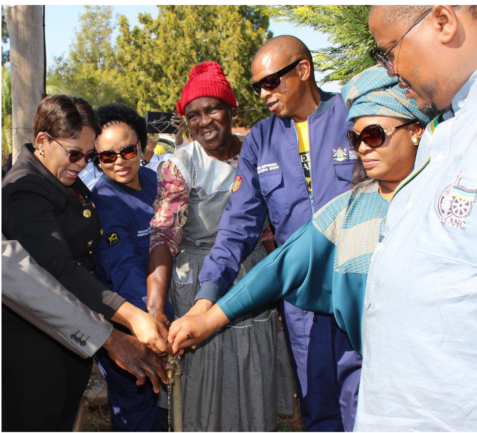
Letona la Metsi le Dikgwerekgwere Nomvula Mokonyane, Tonakgolo ya Leboya Bophirima Supra Mahumapelo le di-MEC pulong ya Porojeke ya Phepelo ya Metsi Jericho.