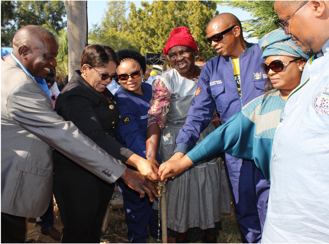
Minisiḡa wa Maḡi na Vhuthathatshili Vho Nomvula Mokonyane, Mulangavunḡu wa Devhula Vhukovhela Vho Supra Mahumapelo, na dziMEC musu hu tshi khou vulwa Thandela ya Netshedzo ya Maḡi Mahayani ngei Jericho.