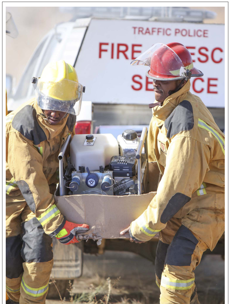
Senthara ntswa ya ndango ya khombo ya Bergville i ḡo vthathu uri miraḡo ya tshitshavha yo tsireledzeho vhuḡoni uvho.

“Hezwi zwi sumbedzisa uri nangoho muvhuso washu wo ḡikumedzela u bvedza vhuḡo ha mahayani. Ro vha ri sa vhuḡo ra humbula uri fhanu Bergville ri nga vha na tshithishi tsha mulilo ri sa hangwi na senthara ya u ita ndingo,”