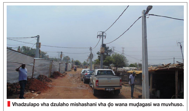
Vhadzulapo vha dzulaho mishashani vha řo wana muřagasi wa muvhuso.

o khethekanywa ha bva zwi-piřa zwiraru. Tshigwada tsha u thoma ndi afho hune řorobo ya řo hu khwinisa hu si kale. Izwi zwi řo tevhelwa nga afho hune ha řo dzhia miřwaha ya 10 uri hu bveledzwe hu uri vha madzulo a tshiteřwa tsha u fhedza vha tshi řo pfuluswa.