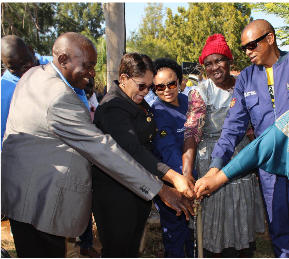
UMphathiswa waManzi noGutyulo uNomvula Mokonyane, iNkulumbuso yaseMntla Ntshona uSupra Mahumapelo, kunye nee-MEC kumsitho wokuvulwa ngokusesikweni kweProjekthi yokuBonelela ngaManzi iPhandle laseJericho.