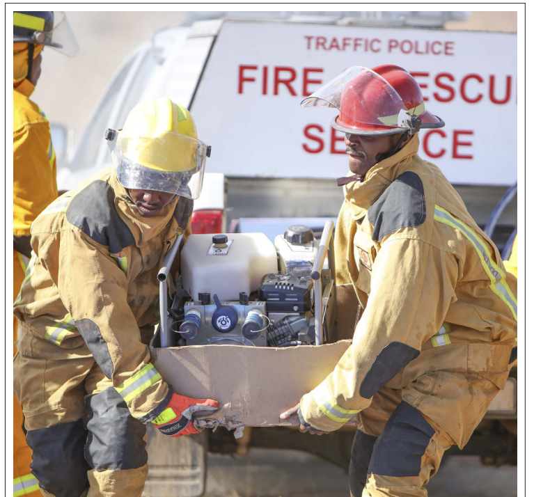
Iziko elitsha leenkonzo zikaxakeka laseBergville liza kuqinisekisa ukuba abantu bakhuselekile kule ndawo.