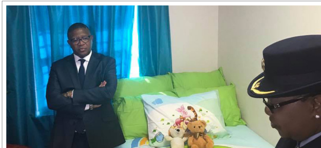
■ Police Minister Fikile Mbalula recently toured a new police station in Malipsdrift, Limpopo. The new police station is equipped with a victim-empowerment protection centre.

PUTTING WORDS into action government, which has allocated R2.5 billion to upgrade, maintain and build police stations, recently opened a new police station in Limpopo.