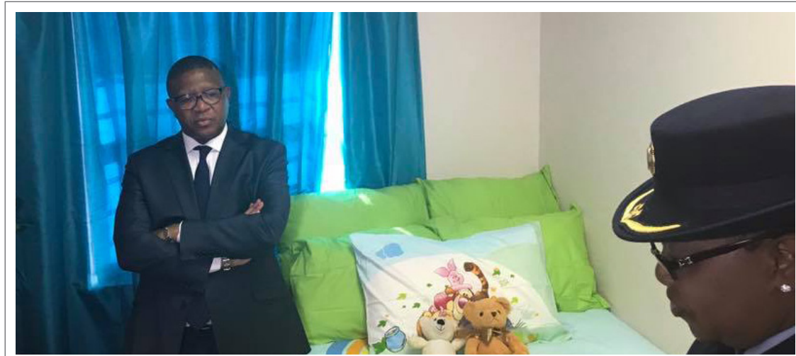
■ Police Minister Fikile Mbalula recently toured a new police station in Malipsdrift, Limpopo. The new police station is equipped with a victim-empowerment protection centre.

PUTTING WORDS into action government, which has allocated R2.5 billion to upgrade, maintain and build police stations, recently opened a new police station in Limpopo.