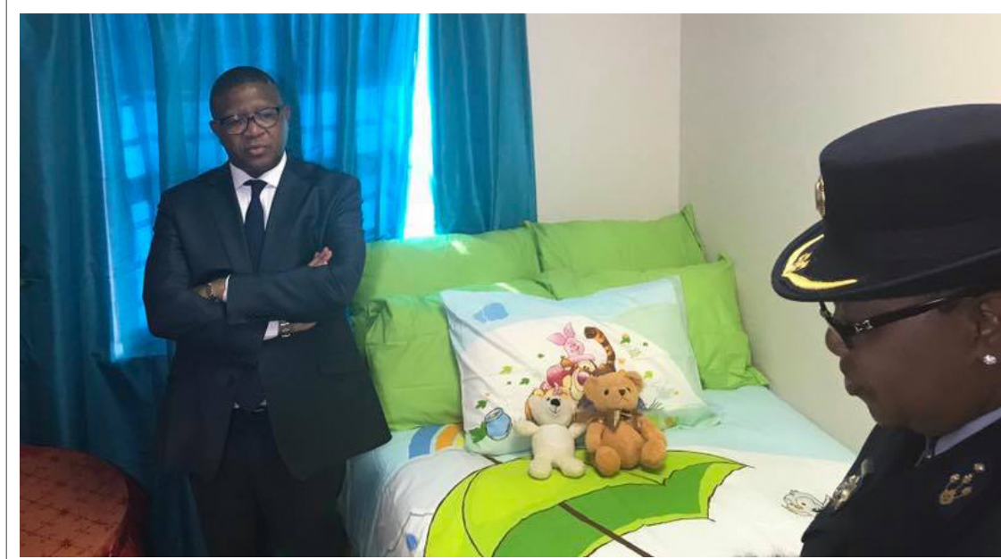
Police Minister Fikile Mbalula recently toured a new police station in Malipsdrift, Limpopo. The new police station is equipped with a victim-empowerment protection centre.

PUTTING WORDS into action government, which has allocated R2.5 billion to upgrade, maintain and build police stations, recently opened a new police station in Limpopo.