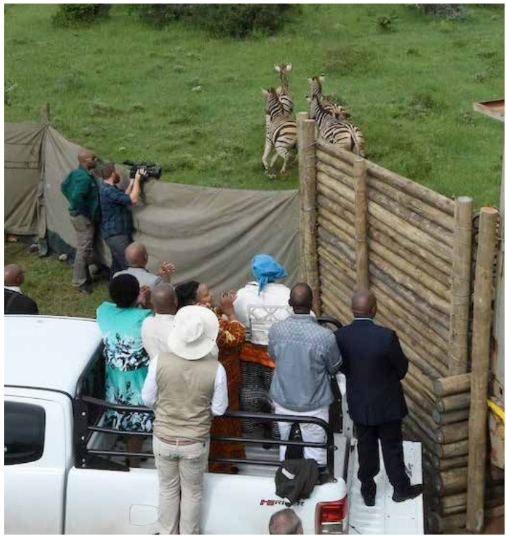
■ Umphakathi wase-Double Drift uyakuthakasela impela ukuba ngabanikazi besiqiwi.

ISIVUMELWANO SOKUBUYISELWA umhlaba ngase-Alice eMpumalanga Kapa sibikezela ukubamba iqhaza nakakhulu kwabantu abamnyama emkhakheni wezokuvakasha.