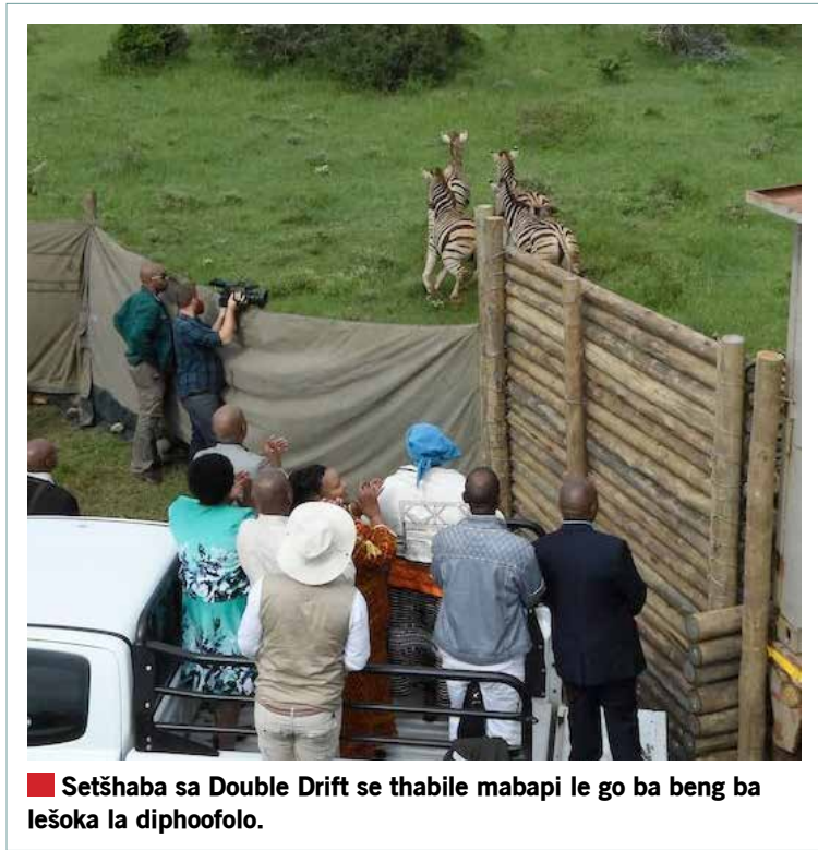
Setšhaba sa Double Drift se thabile mabapi le go ba beng ba lešoka la diphoofolo.

SEPHETHO SA KWANELO ya naga kgauswi le Alice ka Kapa Bohlabela ke taetšo ya gore bathobaso ba bantši ba kgatha tema ka lefapheng la tša boeti.