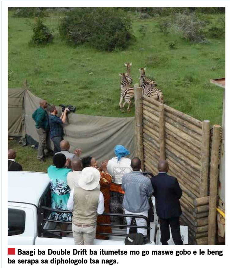
■ Baagi ba Double Drift ba itumetse mo go maswe gobo e le beng ba serapa sa diphologolo tsa naga.

TUMELANO YA LEFATSHE gaufi le motse wa Alice kwa Kapa Botlhaba e rotloetsa gore go nne le bathobatsho ba bantsinyana ba ba tsayang karolo mo lekaleng la bojanala.