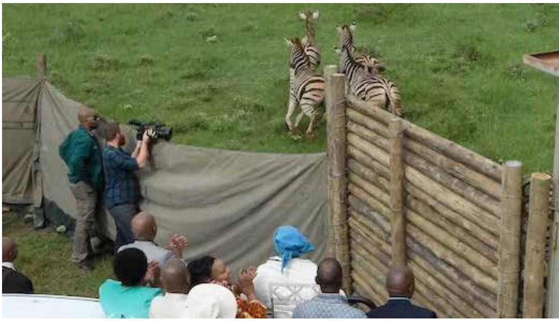
■ Tshitshavha tsha Double Drift vho takalela u vha vhaḅe vha vhugalaphukha.

NYANDANO YA mbuyedzedzo ya mavu tsini na Alice ngei Kapa Vhubvaḍuvha yo vha tshiga tsha vhushelamulenzhe ha vharema vhanzhi kha sekithara ya vhuendelamashango.