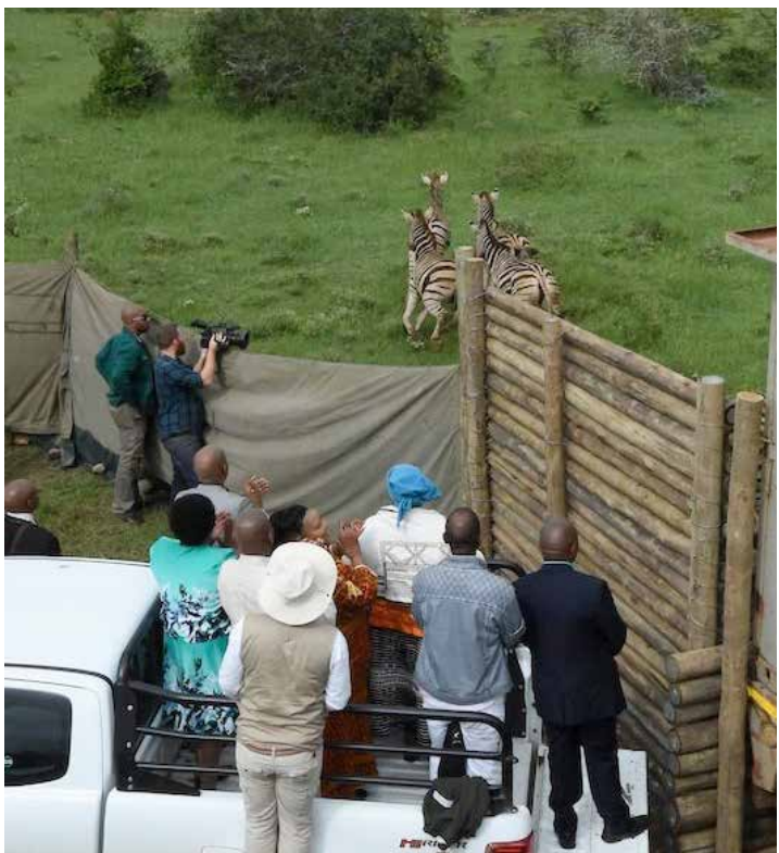
Abantu baseDouble Drift bavuya kakhulu ngokuba nomyezo wezilwanyana zasendle.

ISIVUMELWANO SOKUBUYISELWA umhlaba ongaseDikeni eMpuma Koloni siza kunceda ukuba abantu abamnyama abaninzi bathathe inxaxheba kwicandelo lezokhenketho.