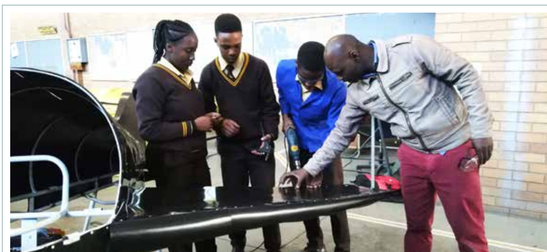
Rhodesfield aviation school is one of 29 schools of specialisation, which have been redesigned to address skills shortage to meet economic demands of the province.

“The school is one of 29 schools of specialisation, which have been redesigned