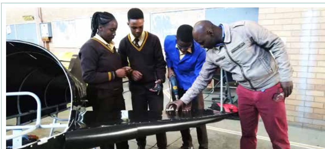
■ Rhodesfield aviation school is one of 29 schools of specialisation, which have been redesigned to address skills shortage to meet economic demands of the province.

"The school is one of 29 schools of specialisation, which have been redesigned