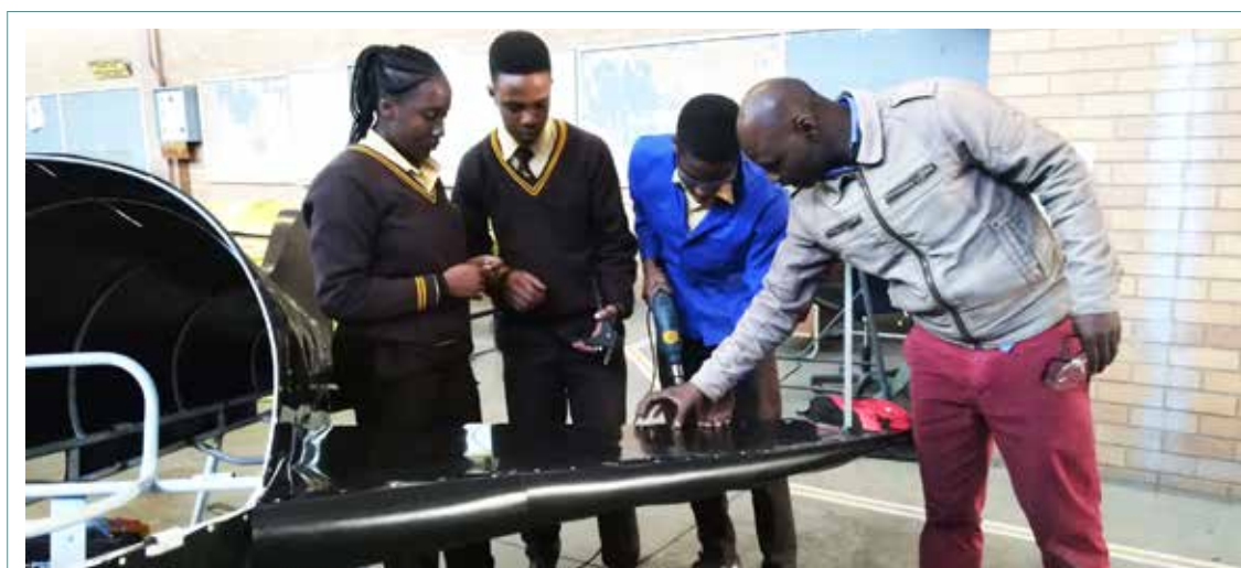
■ Rhodesfield aviation school is one of 29 schools of specialisation, which have been redesigned to address skills shortage to meet economic demands of the province.

"The school is one of 29 schools of specialisation, which have been redesigned