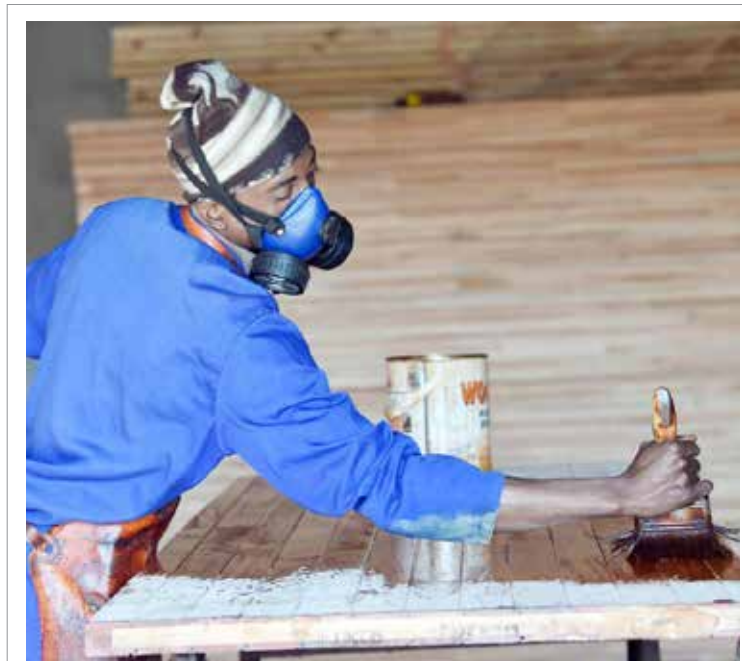
Ngaphansi komthetho Weholo Eliphansi Likazwelonke, abasebenzi abasemikhakheni eminingi kufanele baholelwe okungengaphansi kwama-R20 ngehora.